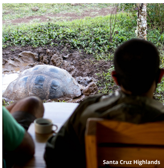
Santa Cruz Highlands

PM: After lunch, we will enjoy a bike ride towards the Northern side of Santa Cruz where we will visit El Garrapatero, a sandy beach surrounded by mangroves. We'll then walk to a freshwater lake behind the beach that is home to flamingos, herons, stilts, and other shorebirds. The beautiful turquoise waters provide a good opportunity for swimming, kayaking, and snorkeling.