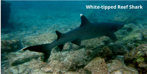
White-tipped Reef Shark