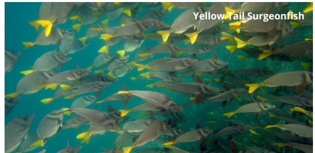
Yellow Tail Surgeonfish

Wildlife: There is a cleaning station with plenty of reef fish. Stingrays, eagle rays, turtles, eels, sea lions, White-Tipped sharks, and a variety of invertebrates can also be found here.